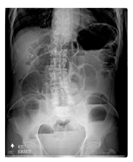
If performed Erect , label image ERECT.