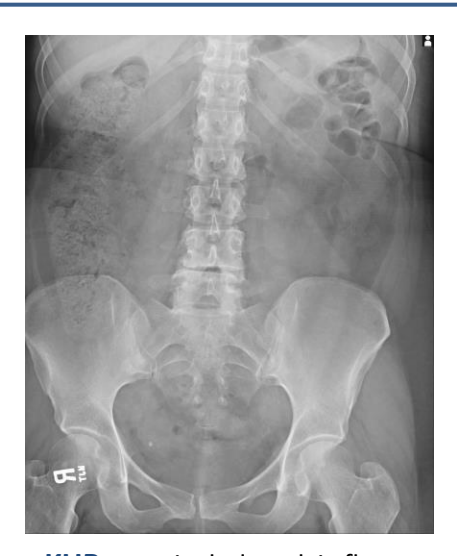
KUB must include pelvic floor.