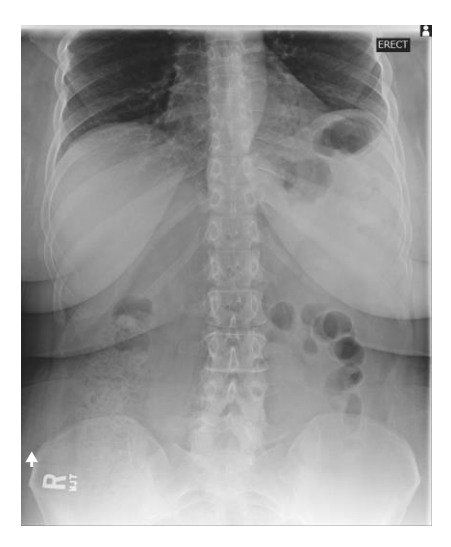
AP Erect Abdomen must include both hemidiaphragms.