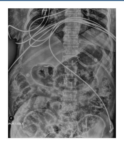
If indication FEEDING TUBE PLACEMENT , pelvic floor need not be included in KUB.

Reprocess with edge enhancement and send both images to PACS.